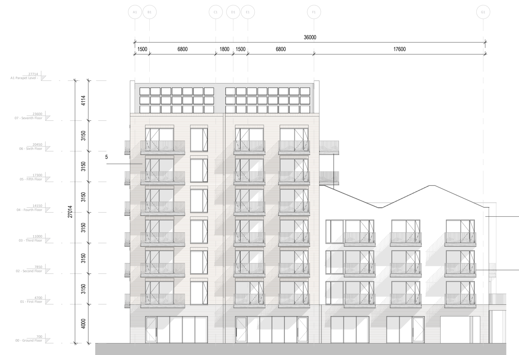
4 A1_South-West Elevation 1:200