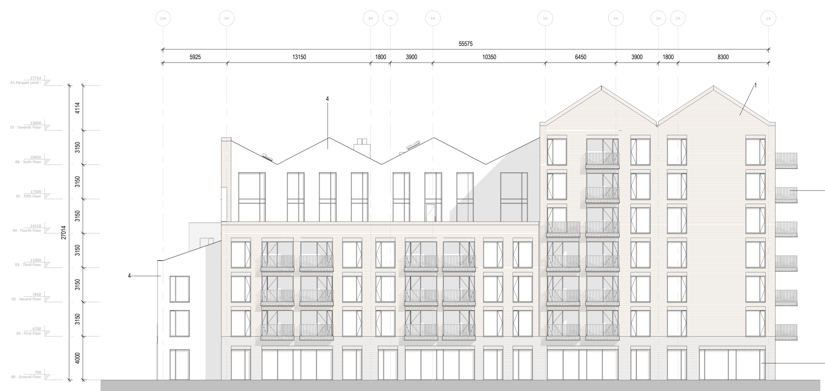
2 A1_North-West Elevation 1:200