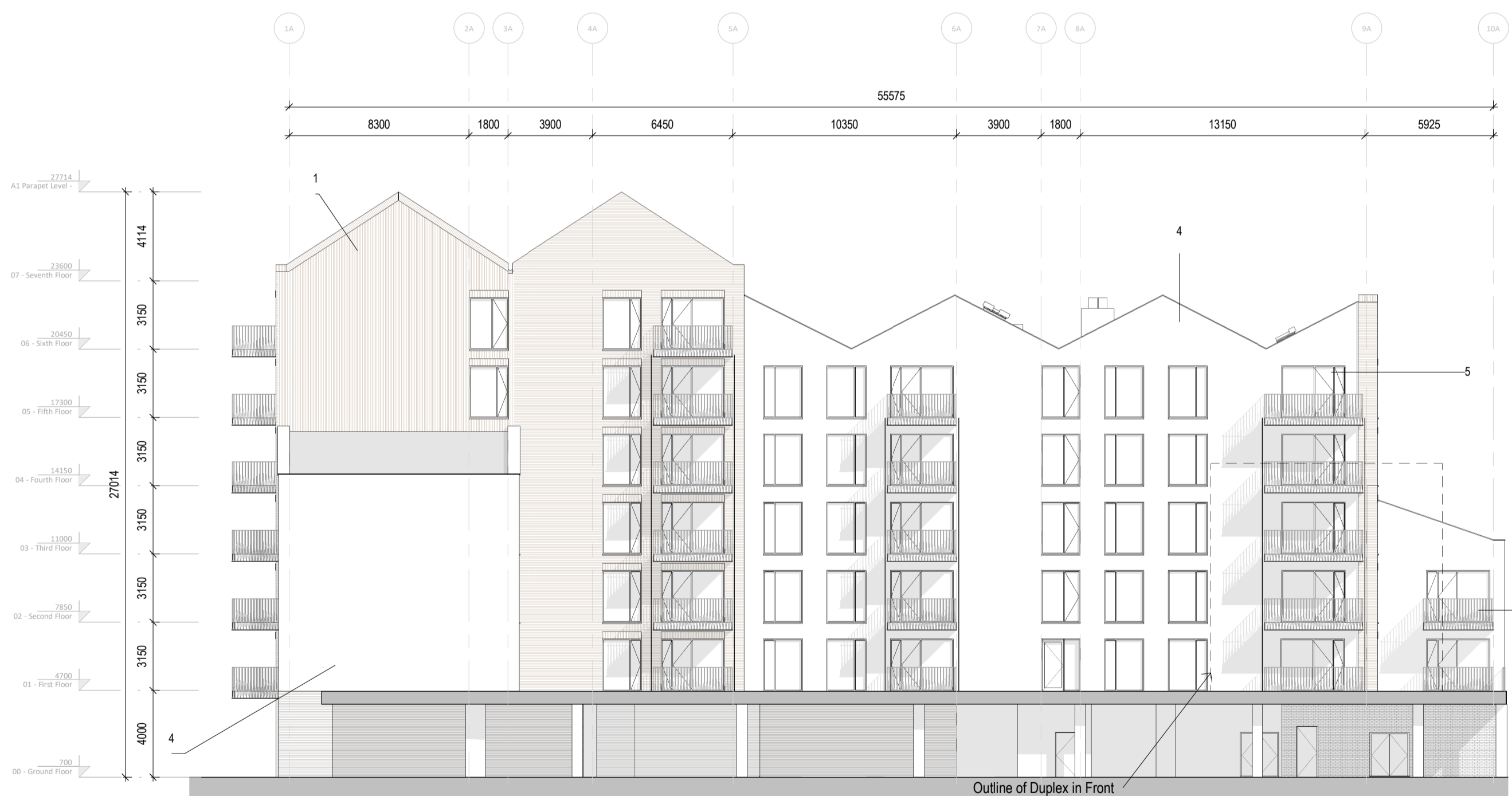
3 A1_South-East Elevation 1:200